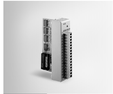
ADAM-5051 ADAM-5051D ADAM-5051S