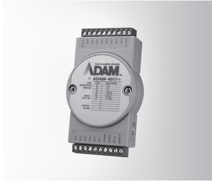
ADAM-4017+ CE FCC RoHS COMPLIANT 2002/95/EC

8-ch Analog Input Module with Modbus 8-ch Thermocouple Input Module with Modbus 8-ch Universal Analog Input Module with Modbus